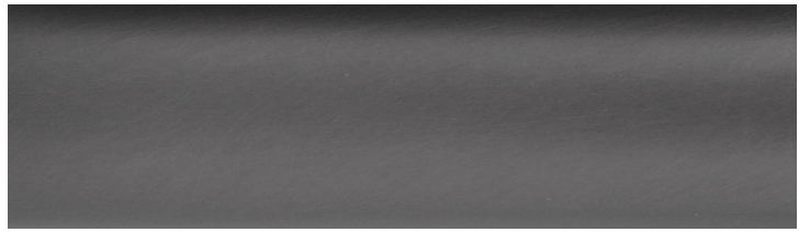
Dark Bronzed Brass