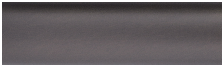
Dark Bronzed Brass